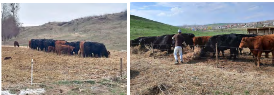
Fig. 13. Manual feeding