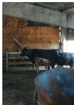
Fig. 3 Cattle stable (original photo - Astra Trifești farm)