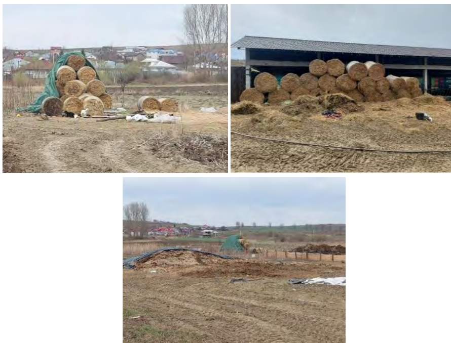
Fig. 12. Bales of natural and alfalfa hay, and maize silage

The diet used in the farm is formed by natural hay (10 kg), alfalfa hay (10 kg), corn silage (5-10 kg), corn cobs (1-2 kg), and concentrates (corn, wheat) (1 kg).