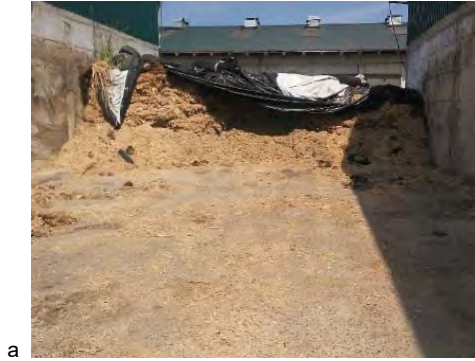
Fig. 8 Fodder base - a. alfalfa hay bales; b. maize silage