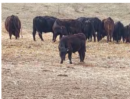
Fig. 6 Adult cattle maintenance during winter time