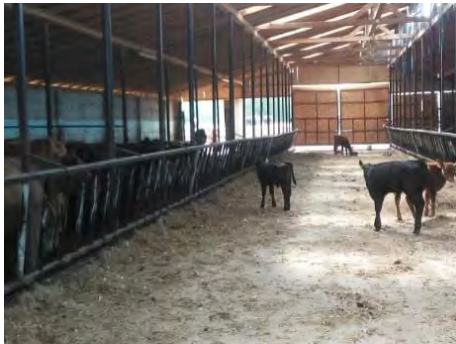
Fig. 1 Calves maintained with mothers

The floor is made of concrete, and in the rest area the bedding is made of straw and sawdust. The manure evacuation from shelter and paddock is carried out every 3-4 months, transporting it to the manure platform. The slurry is picked up with septage and transported and spread on the agricultural lands.