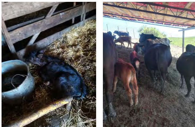
Fig. 4 Calves' maintenance until weaning (original photo - Astra Trifești farm)

c) The family enterprise Percă Fabian - Neamț is a farm whose object of activity is the Angus beef cattle raising, founded in 2017.