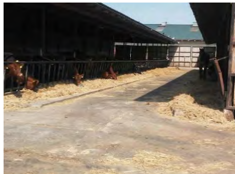
Fig. 2 Male youth in stabulation