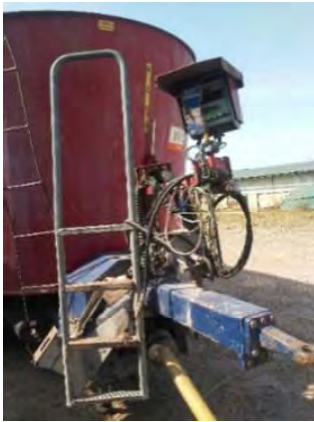
Fig. 9 Technological trailer