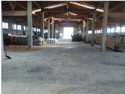
Fig. 10 Storehouse for concentrate fodders and sunflower cake