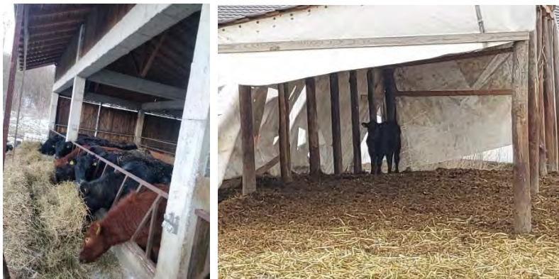
Fig. 5 Semi-open shelter for adults and calves