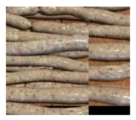
Fig. 1 Fresh sausages with buckwheat

The focus of the research was on raw sausage with added buckwheat. To study the influence of buckwheat flour on the quality and yield of raw sausages, buckwheat flour was used that was produced according to standards. The organoleptic parameters of the flour were as follows: color - light brown, homogeneous, and without foreign inclusions; smell specific to the culture from which it was made; taste - fresh, specific to the culture. To observe the influence of the added buckwheat flour in the sausage recipe, the physicochemical parameters, pH, and organoleptic characteristics of the final product were determined.